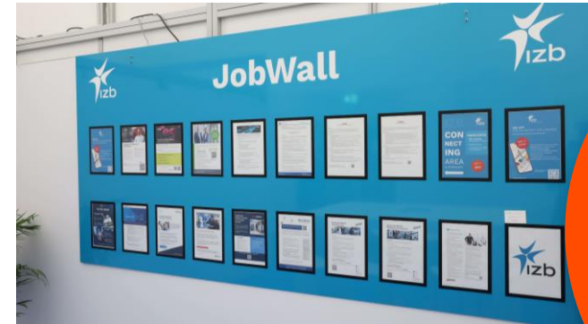
Example: JobWall IZB 2024

Secure prominent placement and increased visibility with the Sponsor Plus package!