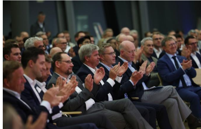
Example: IZB Reception 2024