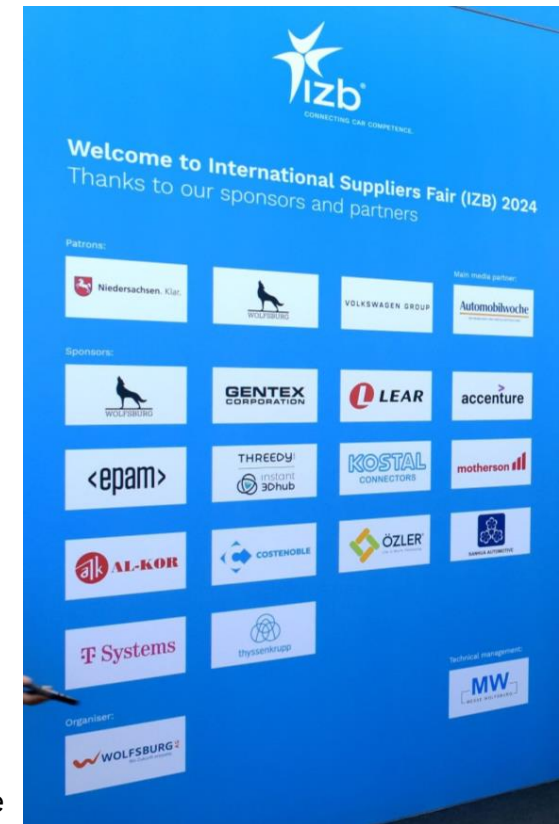
Example: Sponsor and partner Wall IZB 2024