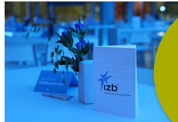
Example: IZB Reception 2024

Welcome guests and decision- makers as an exclusive sponsor of the IZB Reception