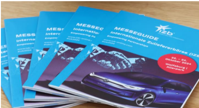
Example: Trade fair guide print IZB 2024

As a logo sponsor, you can present your brand with clear, visible and targeted placement.