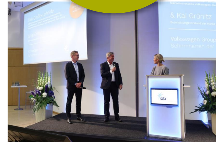
Example: IZB Reception 2024