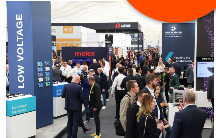
Example: IZB 2024

Secure prominent placement and increased visibility with the Sponsor Plus package!