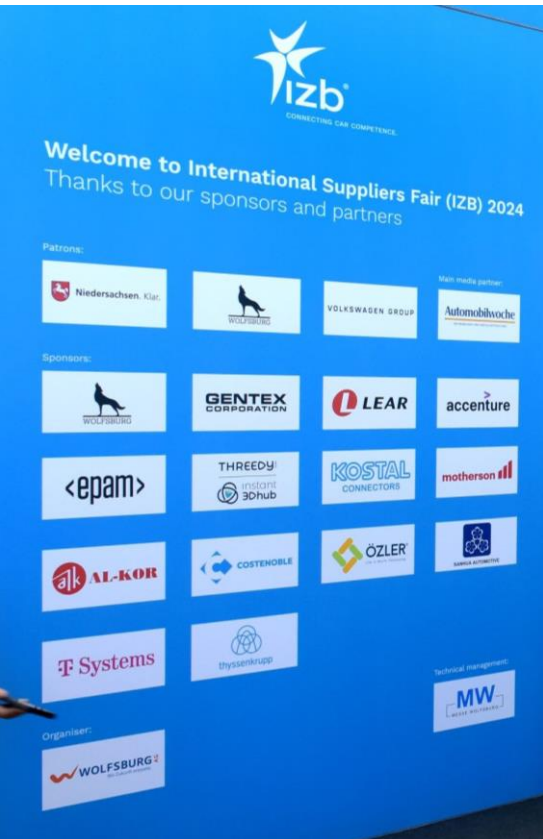
Example: Sponsor and partner Wall IZB 2024