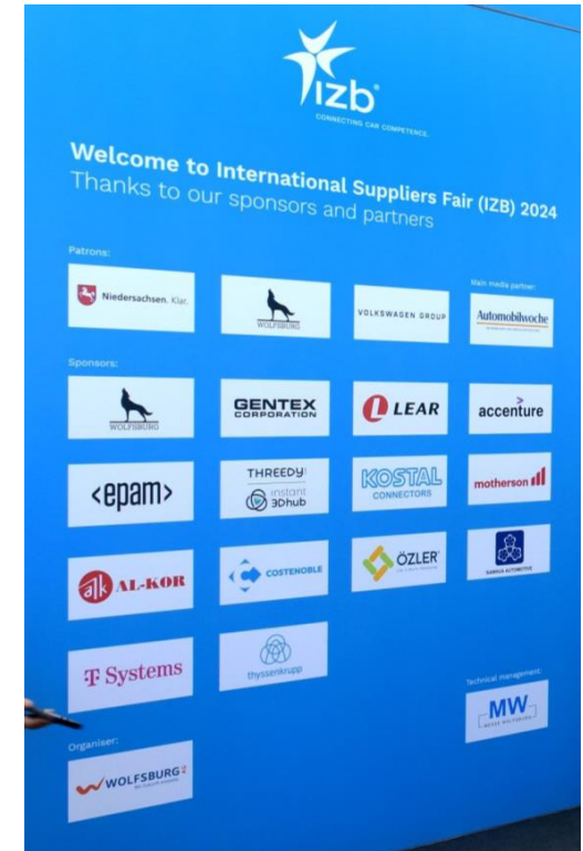
Example: Sponsor and partner Wall IZB 2024