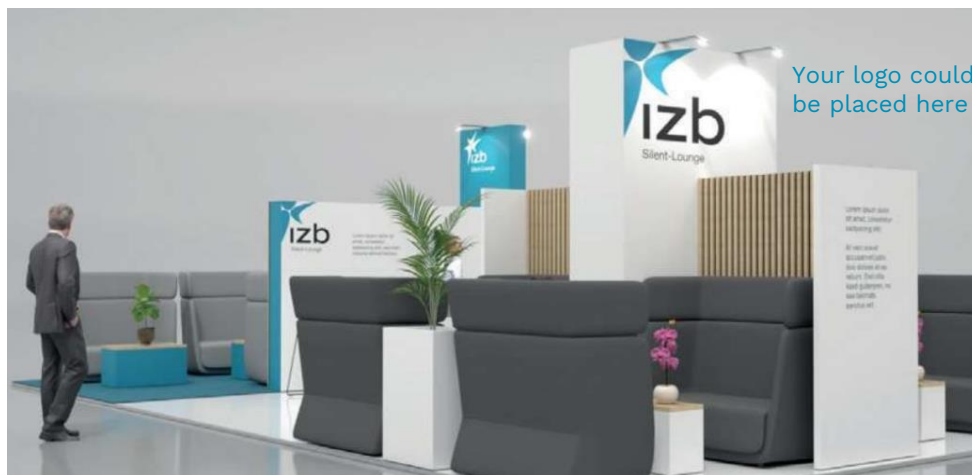
Example: Lounge presentation