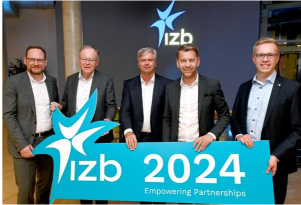
Example: IZB Reception 2024