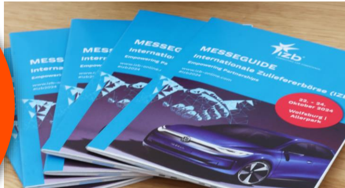
Example: Trade fair guide print IZB 2024

Make the most of the visible presentation of your company in the trade fair setting and benefit from your appearance in our communication measures