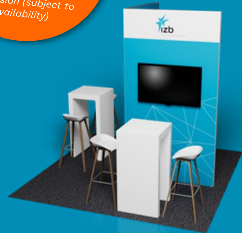
Example, area may differ

Interested? Find out more at: izb@wolfsburg-ag.com