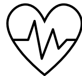
Health & Medical Technology