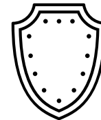
Security & Defence